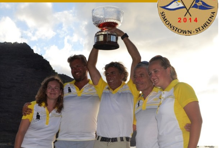
Overall Winners - Black Cat Crew with the Governor's Cup

Some participants chose to sail on from St Helena, with others travelling back on the RMS to Cape Town with their yachts on board.