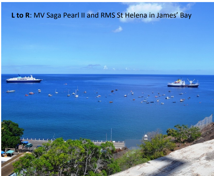
L to R: MV Saga Pearl II and RMS St Helena in James' Bay

En-route from Cape Town to Ascension, this is the MV Saga Pearl II's first visit to the Island.