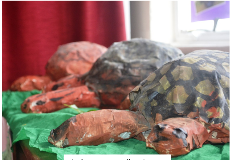
Displays at St Paul's Primary

"I think everything went very well and parents seemed to thoroughly enjoy themselves."