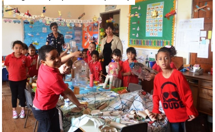
Pilling Primary Crafts