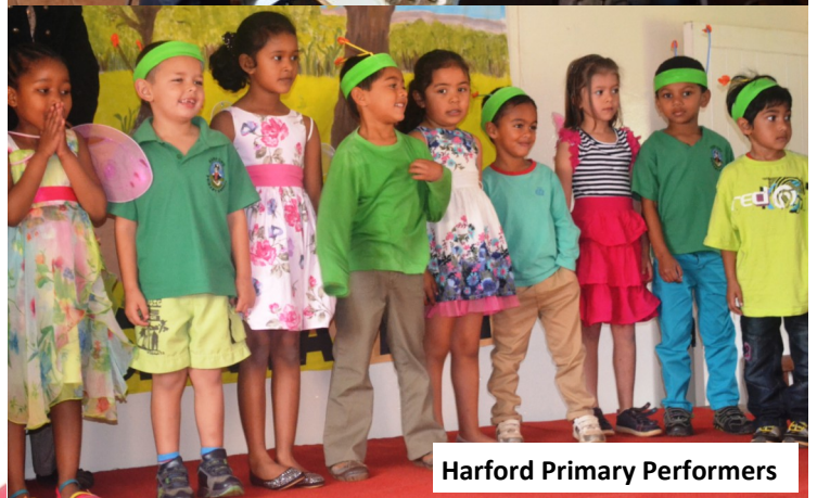
Harford Primary Performers