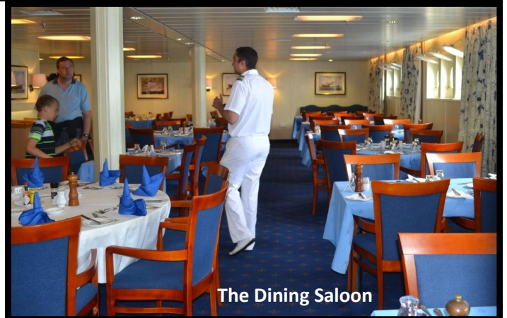
The Dining Saloon

The RMS St Helena hosted an Open Day on Saturday 9 July 2016 while she was anchored in James' Bay.