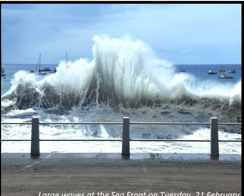
Large waves at the Sea Front on Tuesday, 21 February

Despite the ferocity of the South Atlantic, the rough seas did provide some excitement with many of the community taking a stroll down to the Wharf just to witness Mother Nature's power.