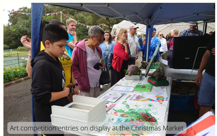
Art competition entries on display at the Christmas Market