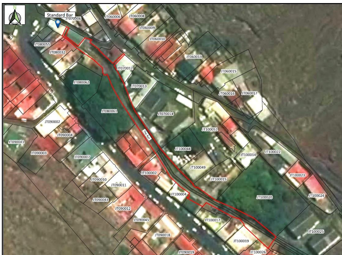
Diagram 1: Location Plan

The Run extends further southwards beyond the current application site.