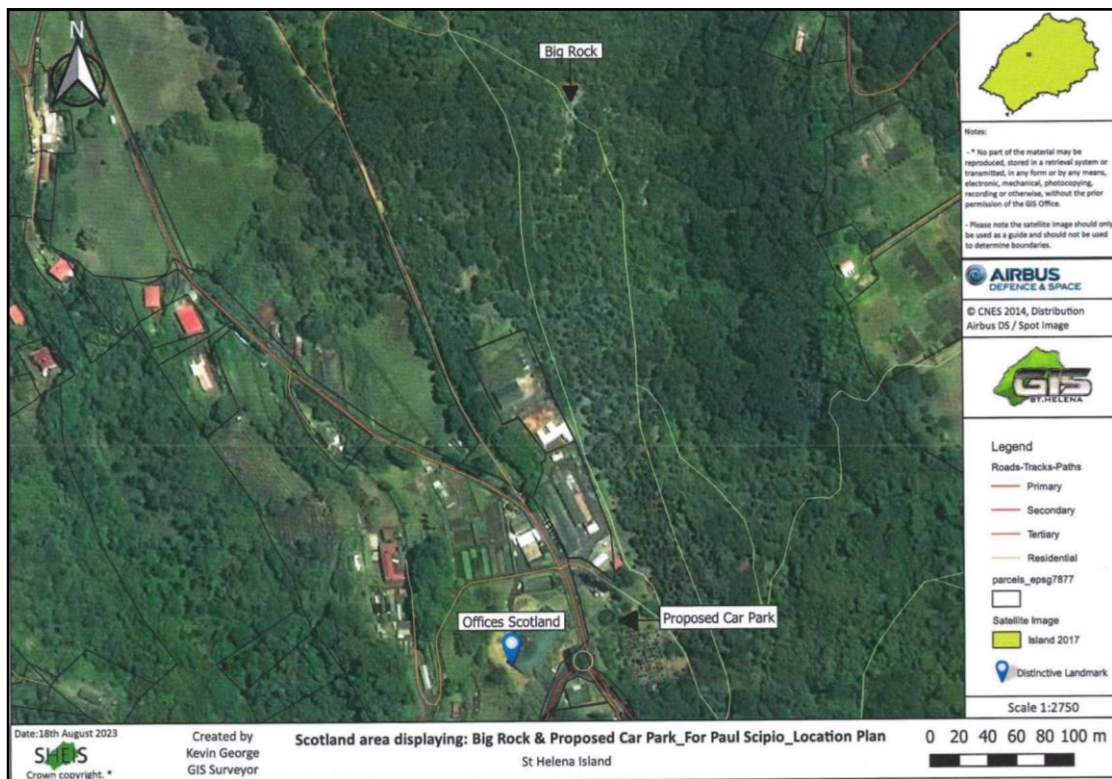
Diagram 1: Location Plan

This plot is located within the forestland of Scotland, where it is designated within the Green Heartland Zone and has no conservation area restrictions.