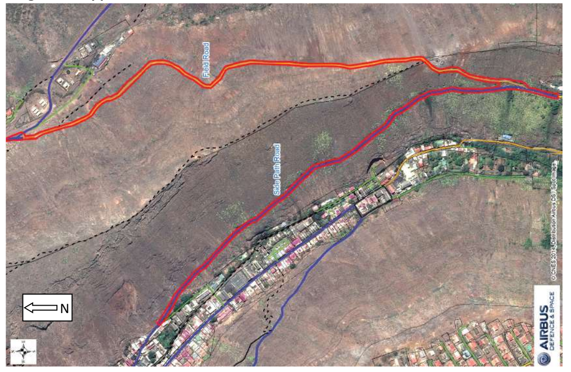
Diagram 2: Application Site Plan