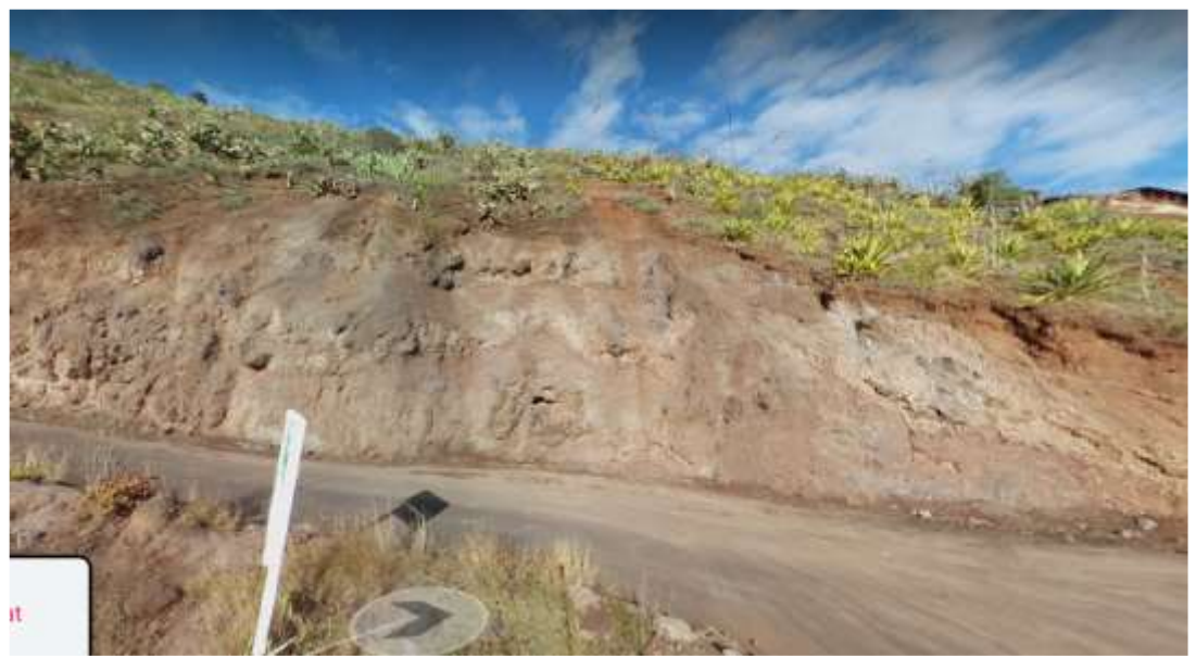
Diagram 3. The Hillside Elevation at the Field Road and Side Path Junction

In order to leave the option open for the applicant to assess the details of this junction alignment, having considered the two options, this can be included as condition should the Authority and the Governor-in-Council be minded to grant development permission. The important issue for consideration is potential visual impact on the landscape arising from the cut-back into the hillside. Given the rugged mountainous terrain and landscape, the level of cut-back into the hillside and the potential slope and treatment required for 10.0m radius junction would not be considered to have any greater or lesser visual impact on the landscape for a 7.5m radius junction in this location. Similarly it is unlikely that the level cut-back into the hillside will have any significant impact on the ecology of the area. This is demonstrated by the photograph of the hillside elevation at the junction.