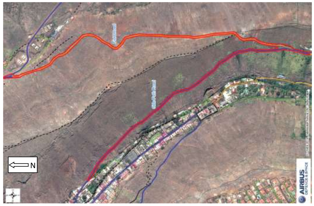
Diagram 2: Application Site