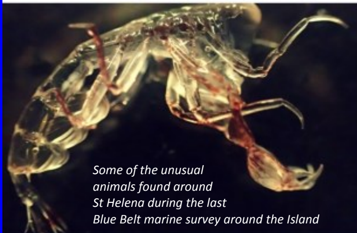
Some of the unusual animals found around St Helena during the last Blue Belt marine survey around the Island