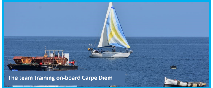
The team training on-board Carpe Diem