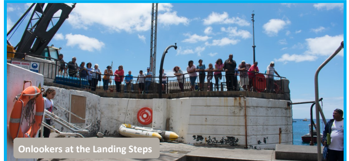
Onlookers at the Landing Steps