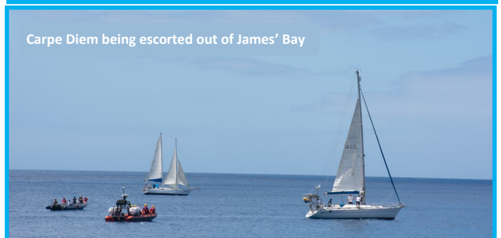
Carpe Diem being escorted out of James' Bay