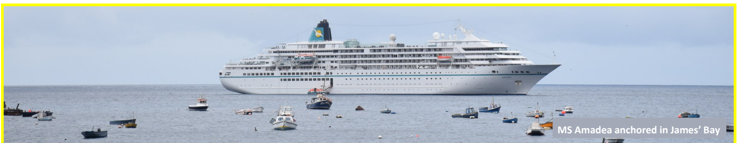
MS Amadea anchored in James' Bay