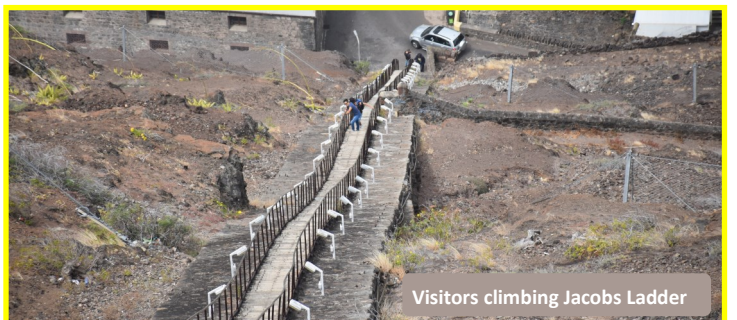
Visitors climbing Jacobs Ladder