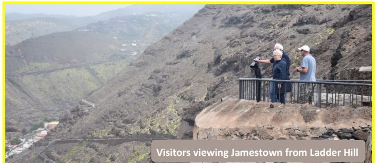
Visitors viewing Jamestown from Ladder Hill

The next cruise ship due to visit St Helena is 'MS The World', from 10 - 12 December 2018.