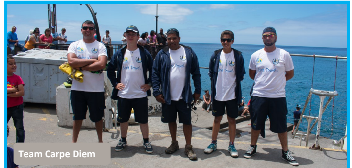
Team Carpe Diem