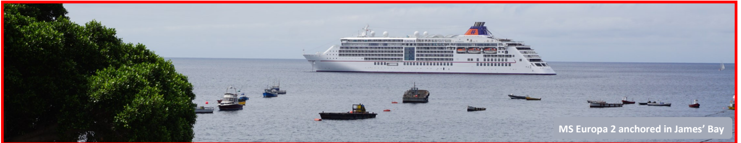
MS Europa 2 anchored in James' Bay