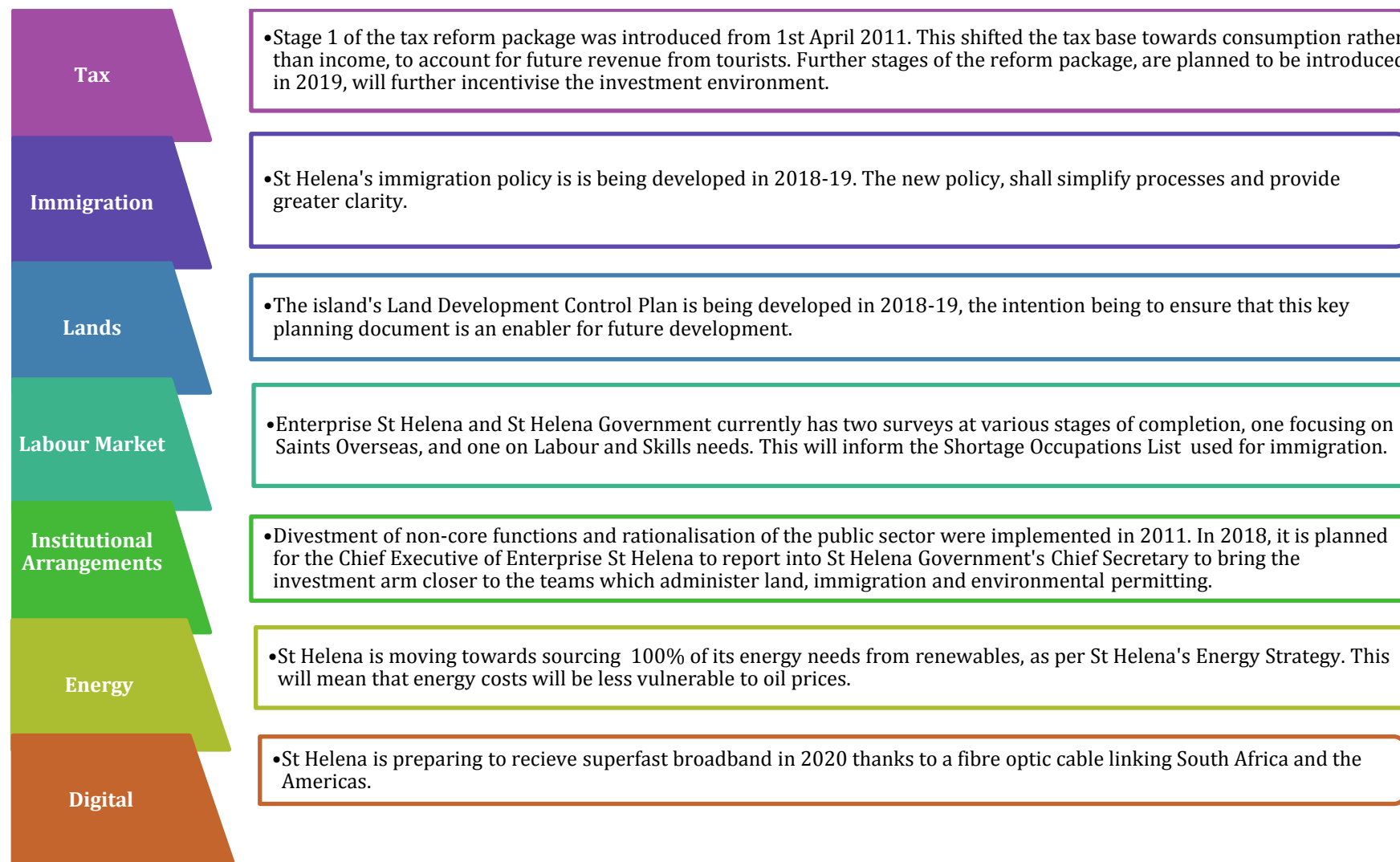
Figure 1: Reforms update: Progress on implementing reforms necessary to open the island's economy to inward investment and increased tourism