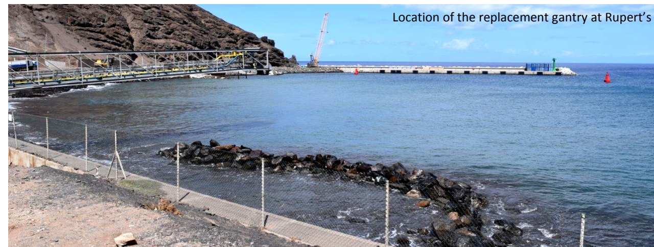
Location of the replacement gantry at Rupert's

Current works include the creation of a temporary rock berm for the construction of the gantry support, and the excavation for foundations shore side.