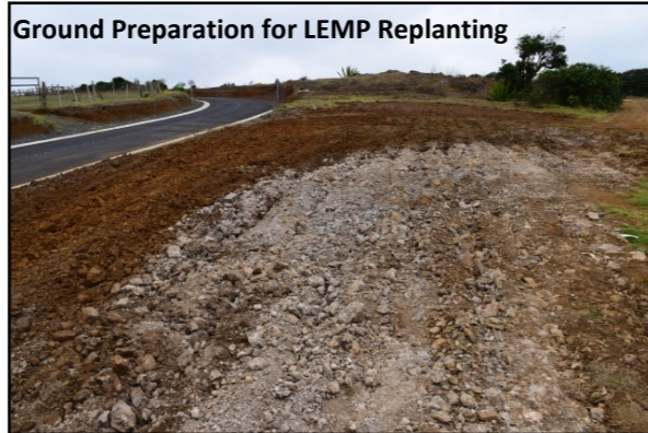
Ground Preparation for LEMP Replanting

Finishing touches to the Access Road continue to be made, including the installation of drainage, new signage, and crash barriers.