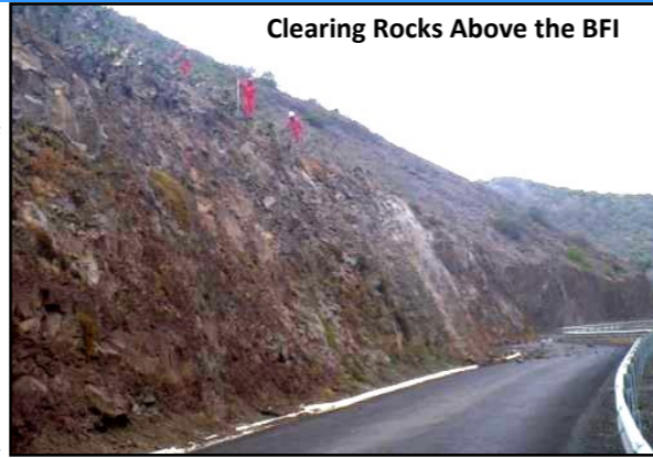
Clearing Rocks Above the BFI

Over the past few weeks, the Rock Guards have been working hard to clear various sections of the Airport Access Road in anticipation of the road opening in 2017. This work was planned as one of the final stages in the construction of the Access Road - and is largely precautionary - to minimise the risk of rock fall.