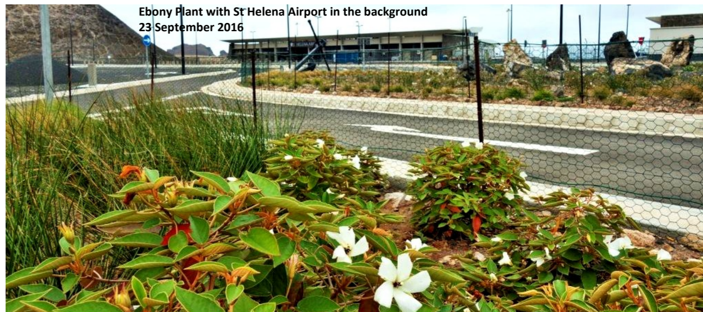
Ebony Plant with St Helena Airport in the background 23 September 2016

Copyright for the content of this newsletter and website belongs to SHG and may only be copied, duplicated or reproduced with prior permission.