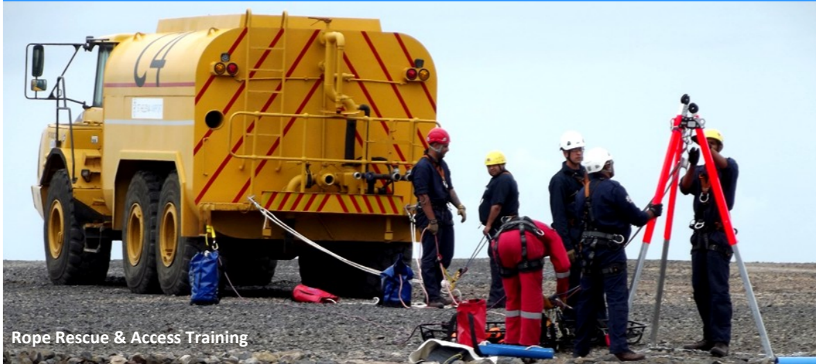
Rope Rescue & Access Training