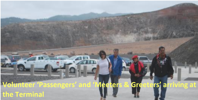
Volunteer 'Passengers' and 'Meeters & Greeters' arriving at the Terminal

For the trial on 7 May, St Helena Airport will only be open to volunteers playing the roles of Passengers and to their accompanying friends & family playing the roles of Meeters & Greeters. The Airport will not be open to the general public on Saturday 7 May 2016. This is to allow staff to test particular scenarios on the day.