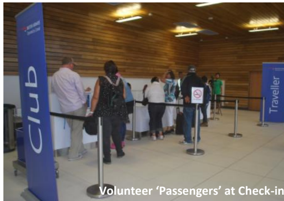
Volunteer 'Passengers' at Check-in