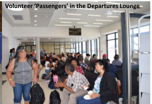
Volunteer 'Passengers' in the Departures Lounge