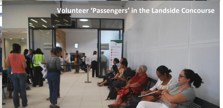
Volunteer 'Passengers' in the Landside Concourse