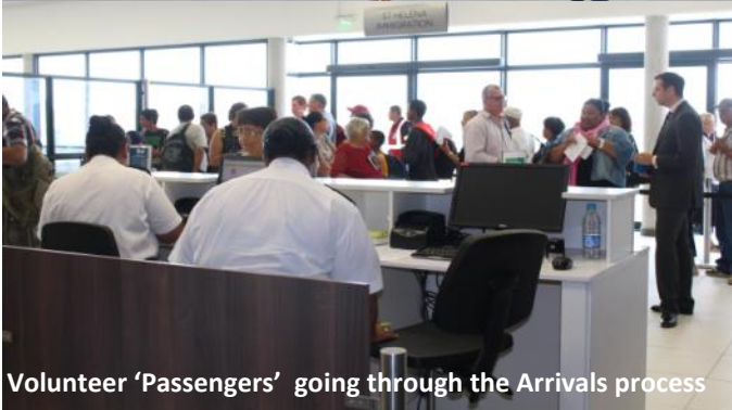
Volunteer 'Passengers' going through the Arrivals process