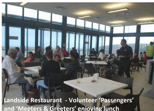
Landside Restaurant - Volunteer 'Passengers' and 'Meeters & Greeters' enjoying lunch