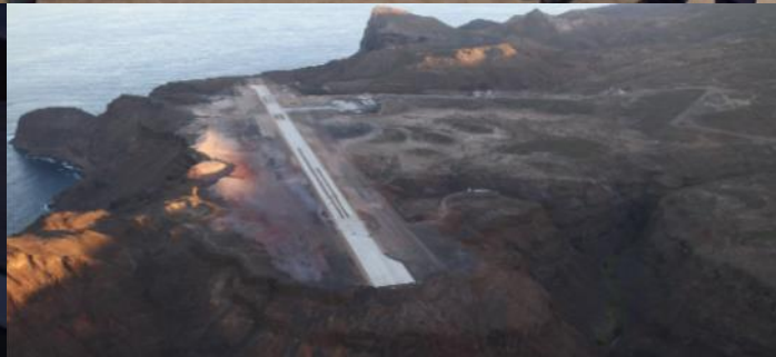
AUGUST 2015 - Completion of Runway, apron, taxiway (above)