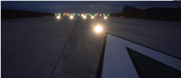
JULY 2015 - Runway Lights Switched On (above)