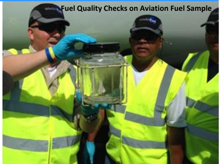
Fuel Quality Checks on Aviation Fuel Sample

During the course, students were updated on the latest legislation and regulations related to airport fuel installations as well as gaining training on the new fleet of fuel tankers which will operate at St Helena Airport.