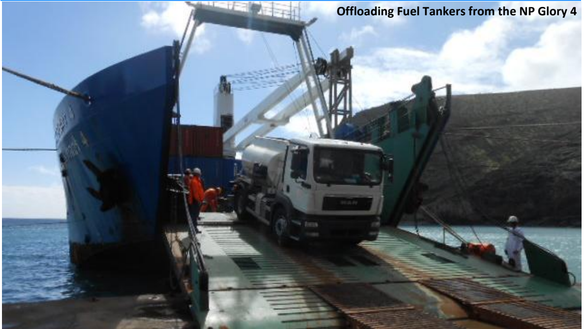
Offloading Fuel Tankers from the NP Glory 4

Penspen Ltd has received five new vehicles to support the Fuel Management Contract. The vehicles comprises two 5,500 litre ground fuel vehicles for diesel and gasoline, two 18,000 litre aircraft refueller vehicles to be based at the Airport and one 12,000 litre bridger vehicle which will transport aviation fuel from the new BFI in Rupert's Valley to the Airport Fuel Facility, via the Airport Access road. All five vehicles were shipped to Walvis Bay from the UK on the Sanderling Ace on 10 July 2015 and were then brought to the Island by the NP Glory 4 on Wednesday 22 July 2015.