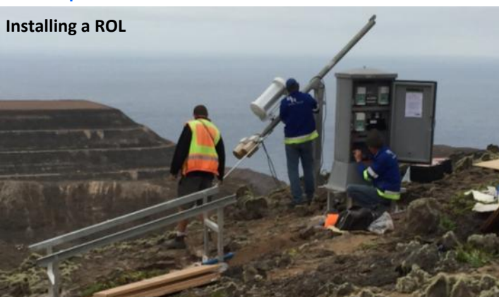
Installing a ROL