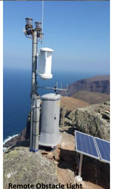
Remote Obstacle Light

These Remote Obstacle Lights are vital to the safe operation of the Airport and to aircraft arriving and leaving St Helena. They must not be tampered with or vandalised. If you see anyone vandalising or interfering with a ROL, please report them to the Police immediately. Likewise, if a ROL appears to have been damaged, please inform the Airport Manager as soon as possible.