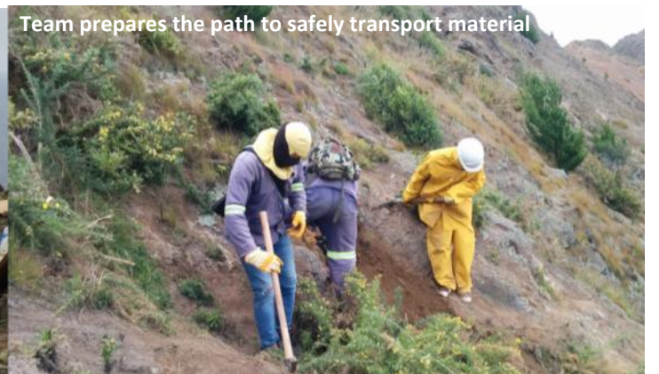
Team prepares the path to safely transport material