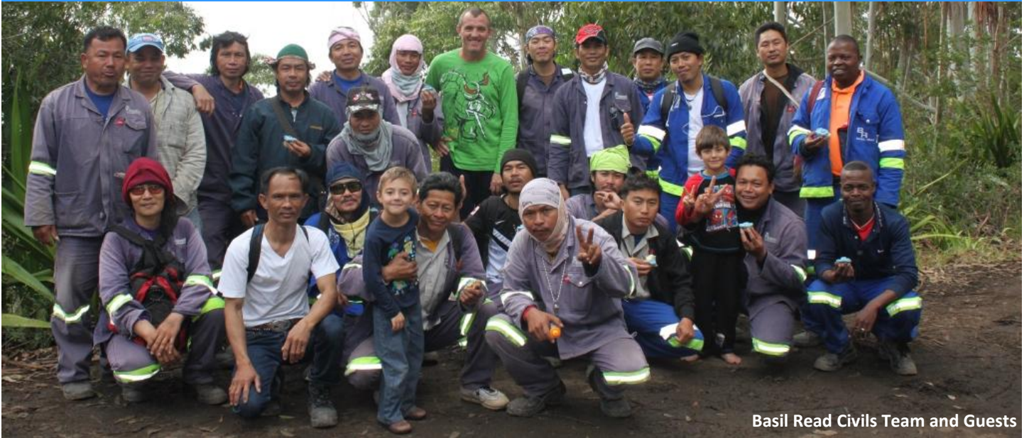
Basil Read Civils Team and Guests

The Remote Obstacle Lights (ROLs) are part of a suite of Navigational Aids (NAVAIDS) used to assist aircraft in landing and departing, and in particular, to identify areas of high ground. Basil Read, in conjunction with sub-contractor Thales, is installing 12 ROLs in the vicinity of the Airport - located at King and Queen Rocks, Bencoolen, Horse Point, Bradley's, Great Stone Top and The Barn.