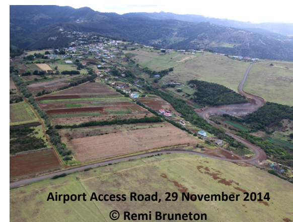
Airport Access Road, 29 November 2014