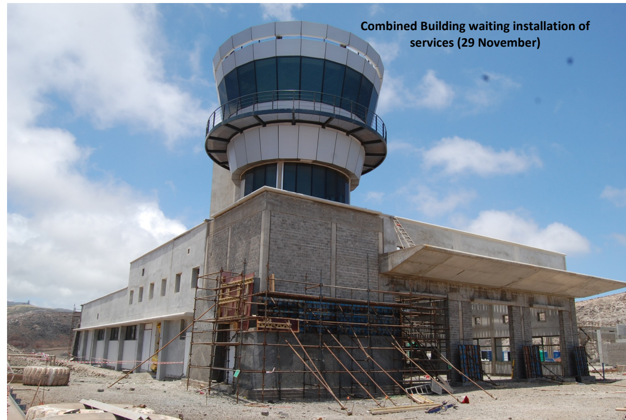
Combined Building waiting installation of services (29 November)

Progress at Prosperous Bay Plain on the Terminal Building wing canopy and brickwork.