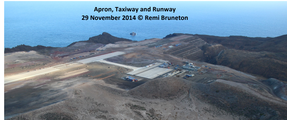
Apron, Taxiway and Runway 29 November 2014

On the seaward side of the blocks, core and under layer rock is also being positioned. These will be protected with precast CORE-LOC armour units.