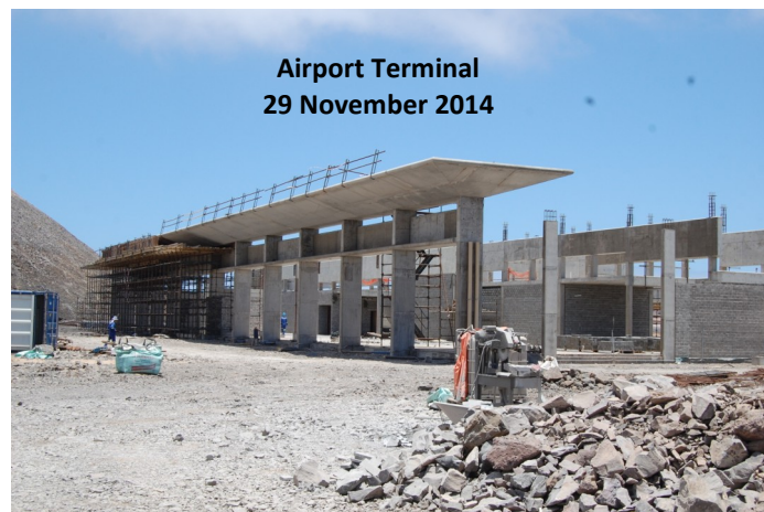
Airport Terminal 29 November 2014

Concreting on Airport Apron now 80% complete