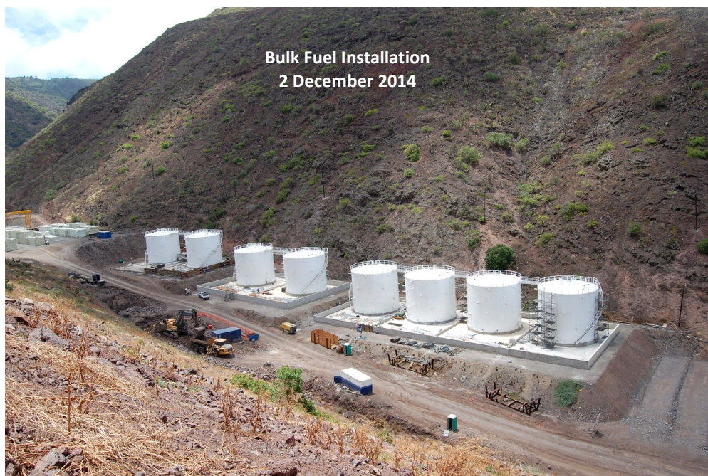
Bulk Fuel Installation 2 December 2014

The Airport Access Road linking Rupert's to Prosperous Bay Plain is now more than 50% complete