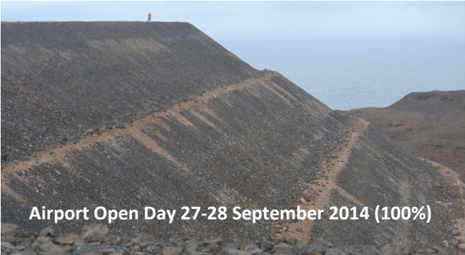
Airport Open Day 27-28 September 2014 (100%)