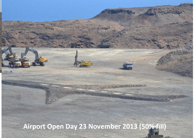
Airport Open Day 23 November 2013 (50%-fill)

Both St Helena Government and the UK Government hope that this will lead to eventual financial self-sustainability for St Helena. Since the signing of the contract, the Airport project has achieved many milestones. These include the construction of the Haul Road, erection of the Airport Buildings and the filling of Dry Gut.