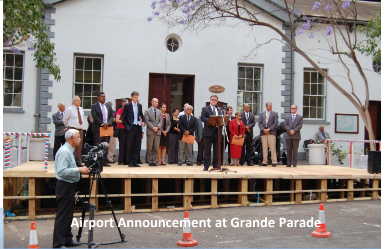
Airport Announcement at Grande Parade

O n 3 November 2011, St Helena Government signed a Design, Build and Operate (DBO) contract in DFID's London Office with Basil Read (pty) Ltd. The contract was to design, build and operate St Helena's Airport and this was announced at the Grand Parade, St Helena on the same day. The project aims to provide air access to St Helena, fulfilling the UK Government's commitment to maintain access to the Island, and at the same time providing St Helena with a real opportunity for economic growth through tourism.