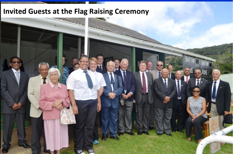
Invited Guests at the Flag Raising Ceremony