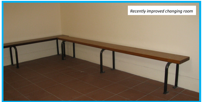
Recently improved changing room