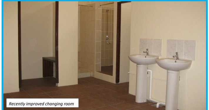
Recently improved changing room