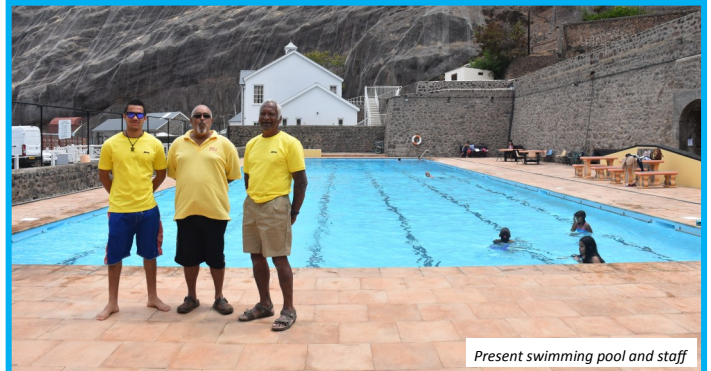
Present swimming pool and staff