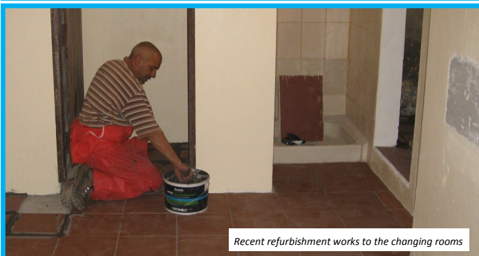
Recent refurbishment works to the changing rooms

earlier Tennis Court. Since the official opening, the pool has undergone minor refurbishments. In 2016, an Island drought highlighted a leak within the pool, and a decision was taken to close the pool. This led to 'the Swimming Pool Project' which saw the filtration and pipework system replaced, appearance of the pool and changing rooms improved and the restoration of the heritage wall.