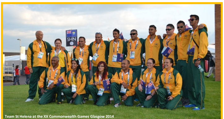
Team St Helena at the XX Commonwealth Games Glasgow 2014