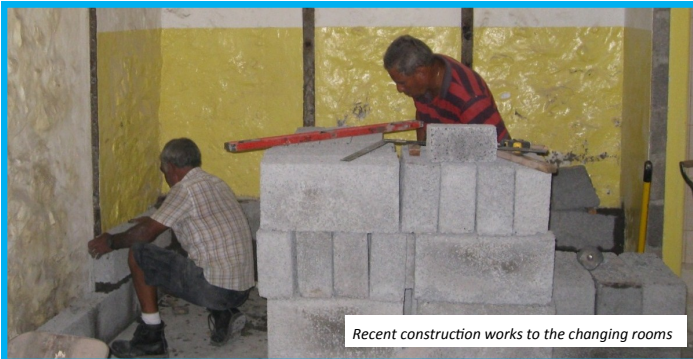
Recent construction works to the changing rooms