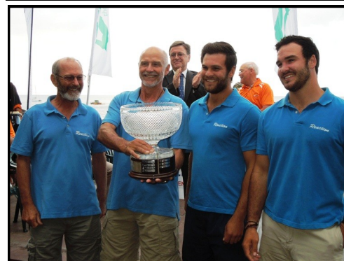
Reaction Crew with Governor's Cup