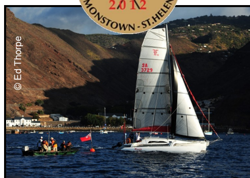
Banjo takes Line Honours on 1 January