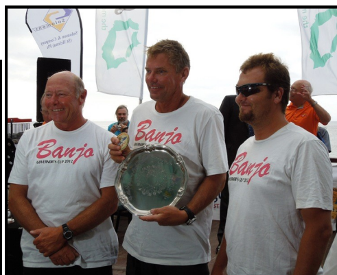
Banjo Crew receiving their prize at Donny's