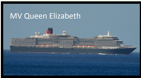
MV Queen Elizabeth

The MS Queen Elizabeth passed James Bay on Thursday 21 January 2016. She did not stop for a visit, but came in close enough for the people of St Helena to have a clear view of the ship.