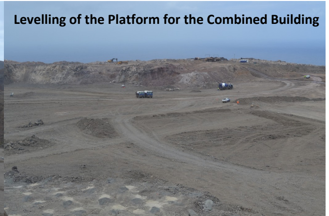
Levelling of the Platform for the Combined Building