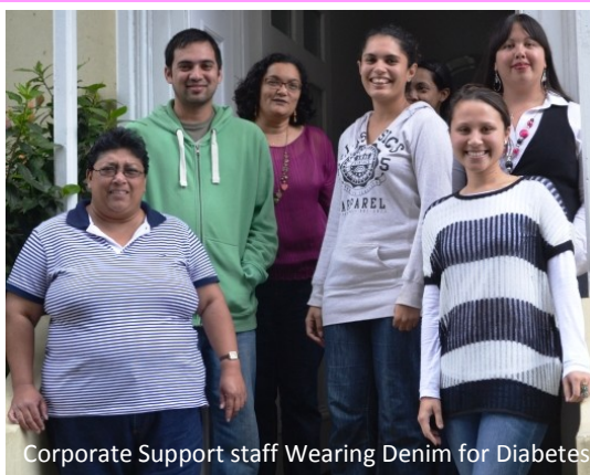
Corporate Support staff Wearing Denim for Diabetes

National Diabetes Week is normally held every June and the sessions here on St Helena were to raise awareness of the seriousness of diabetes and to educate the public on how to avoid complications related to the condition. At each session there were information stalls on diabetes and how it can be prevented and controlled. Government Directorates, Schools and other organisations were also encouraged to take part in a Mufti Day - 'Wear Denim for Diabetes' - to raise awareness of the condition and raise funds to help the cause.