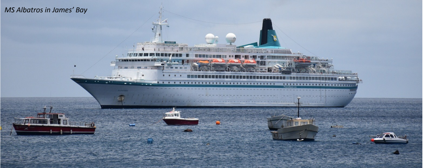
MS Albatros in James' Bay

The cruise ship, MS Albatros, operated by a German based travel agency, anchored in James' Bay at 7am on Tuesday, 31 October 2017. Built in Finland in 1973, the MS Albatros has ten decks, two main restaurants, two small movie theatres, cabins with an ocean view, one large swimming pool, a spa and gym.