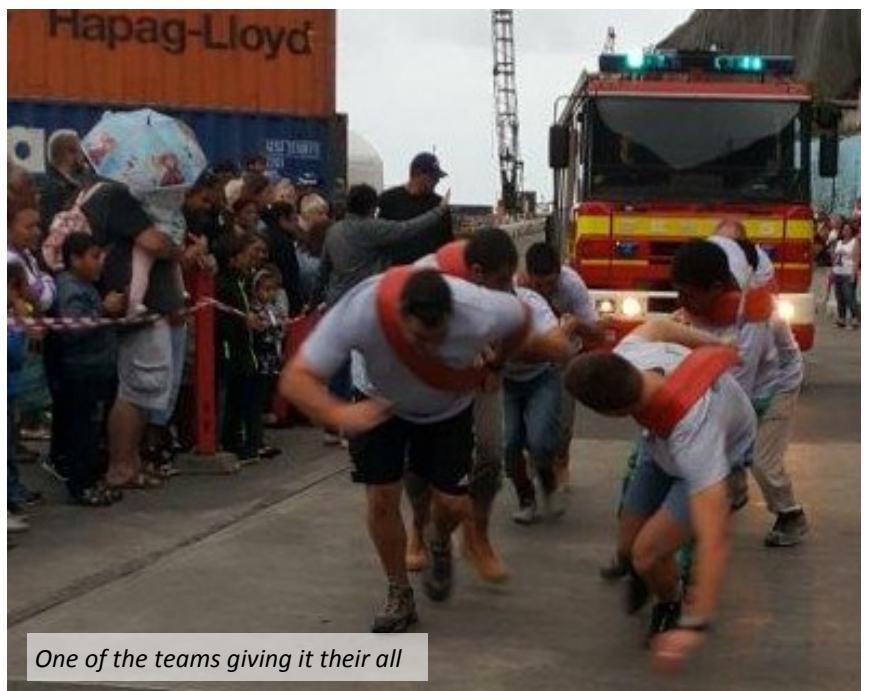
One of the teams giving it their all

On Thursday, 19 October, the Charity hosted a stall in the market. 'Pink Panther and Friends' were about town and raised a total of £360. In the evening a Quiz Night was held at the Mule Yard.