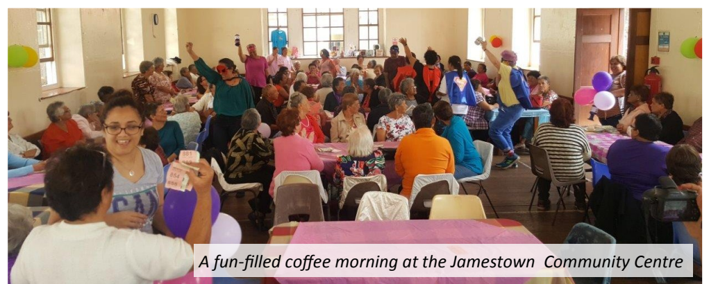
A fun-filled coffee morning at the Jamestown Community Centre

Saturday, 7 October, saw a team from the Education & Employment Directorate complete a Super Hero relay challenge around the Island, raising over £1500, before joining the traditional Coffee Morning at the Jamestown Community Centre. Moonshines Bar, in Blue Hill, organised a dance and raffle on 14 October raising £540 for the charity.