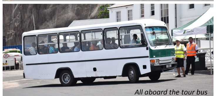
All aboard the tour bus