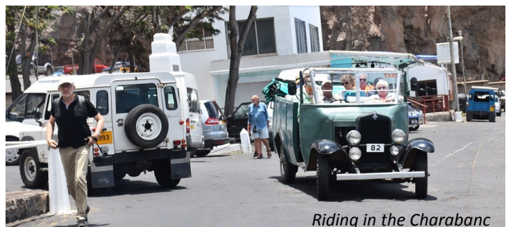
Riding in the Charabanc

The next cruise ship visit to the Island is the MV Boudicca on 16 February 2018.