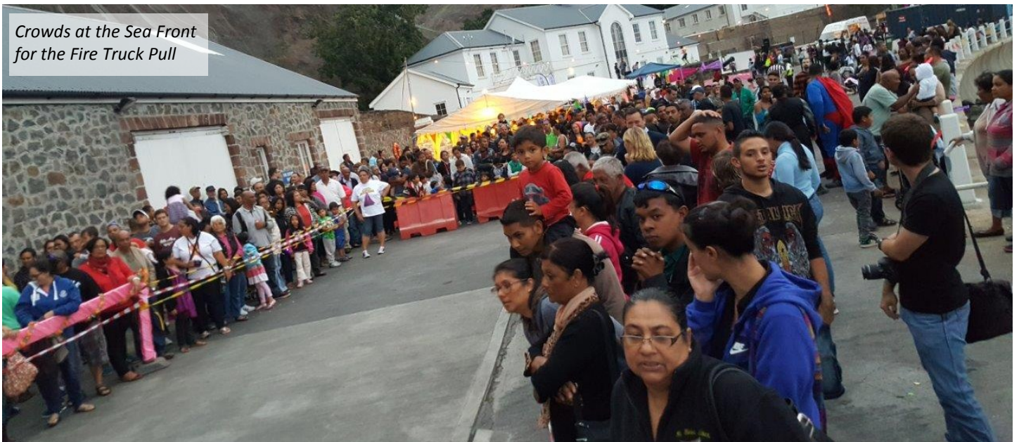
Crowds at the Sea Front for the Fire Truck Pull