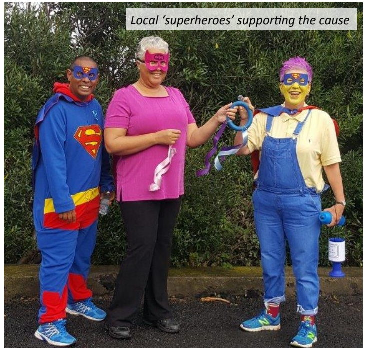
Local 'superheroes' supporting the cause