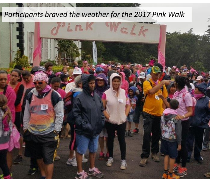
Participants braved the weather for the 2017 Pink Walk

Sunday, 22 October, saw 231 participants brave the wind, fog and mist as they took part in the Pink Walk which was hosted at Plantation House, this event raised over £2400.