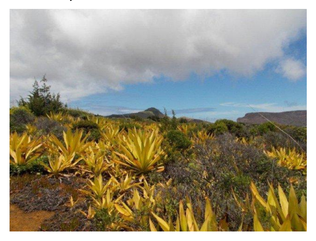
Bottom Woods - a large new settlement for St Helena?

The cost of bringing the homes up to the minimum standard is far higher than predicted - equal to over three times what we charge in rent, for each of the next 30 years